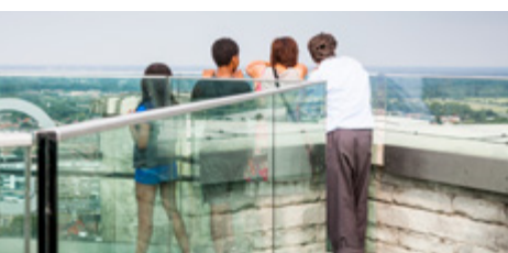
Skywalk St. Rumbold's Tower, Mechelen