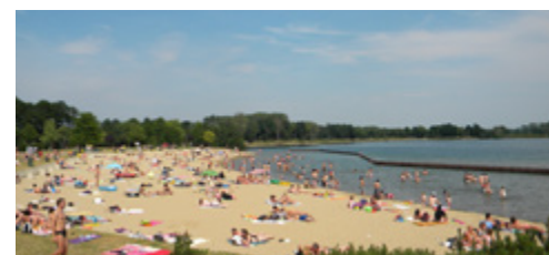
The Nekker Provincial sports and leisure Centre